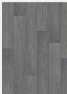
MONTE CARLO L94