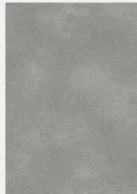
LONDON STONE T98