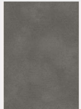
LONDON STONE T99