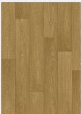
MONTE CARLO L41