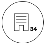
Commercial very heavy