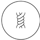
Tight twist set