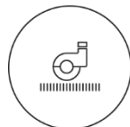
Castor wheel resistant