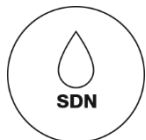
Solution dyed nylon