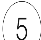
5 year guarantee