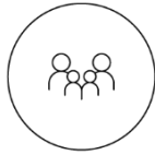
Great for families