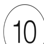
10 year guarantee