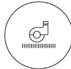
Castor wheel resistant